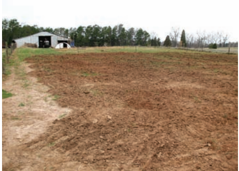
Fig F1. Field preparation prior to planting Fig. F2 Renovated field ready for planting