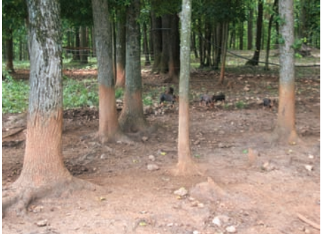
Fig. H1-2 Evidence of tree damage by hogs