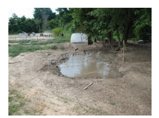
Figure C1-3. Examples of wallows