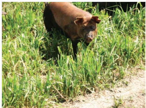
Figures B1-2. Hogs on ground cover