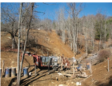
Fig. G1-2. Lack of buffers on hog farms contributes to soil erosion and runoff