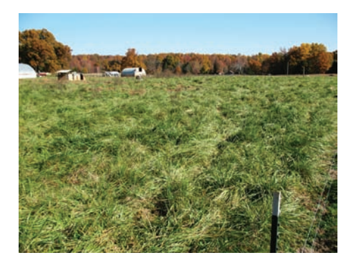
Fig. E1. Field area after hogs