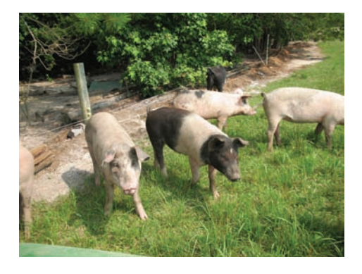
Fig. 12—Low hog stocking density