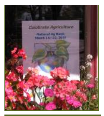
Poster in window in downtown Livermore

(cont. from page 1) would like to increase awareness of the producers of agriculture in their community this includes the 4H and FFA youths with their horticulture and livestock projects. Increased awareness will encourage the Alameda County community to select locally grown products such as wine, olive oil and pistachio nuts, and to support the agriculture education youth programs.