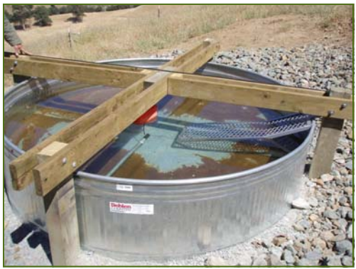
Example of water trough built with matching EQIP funds. Notice the critter ramp.

In fiscal year 2008 California NRCS partnered with farmers and ranchers on nearly $54 million in conservation cost share contracts, setting a new record for the program in the state. Alameda County was allocated over $300,000 of that year's funding. This matched the landowner's $300,000 contribution. The contracts covered a broad spectrum of natural resource