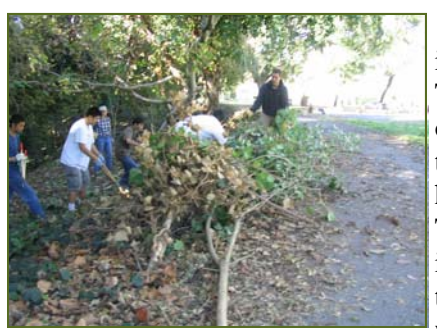
Logan High School students doing ivy removal.

This winter, students from Logan High School in Union City have been working to "Free the Trees"- in other words, remove the thick vines of invasive Algerian ivy that are climbing up the trunks of the huge trees that line the banks of historic Alameda Creek in William Cann Park. The ivy damages the bark of the tree, and when it reaches the upper branches and crown of the tree, it causes it to become top-heavy, and in winter storms the whole tree can topple over. If