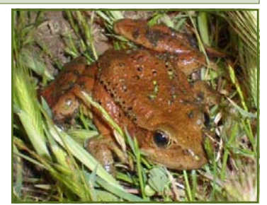
A California red-legged frog hides in the grass during field study at our

Other events include a celebration of National Ag Week, March 16-20 and a poster workshop in Spring '08. contest for the National Association of