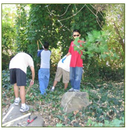
Cutting ivy from trees at Cann Park.

This winter, students from Logan High School in Union City have been working to "Free the Trees"- in other words, remove the thick vines of invasive Algerian ivy that are climbing up the trunks of the huge trees that line the banks of historic Alameda Creek in William Cann Park. The ivy damages the bark of the tree, and when it reaches the upper branches and crown of the tree, it causes it to become top-heavy, and in winter storms the whole tree can topple over. If