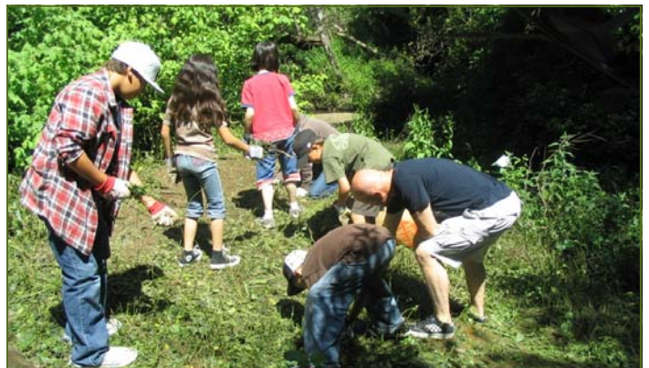
Students and a parent helper pull invasive vinca from the creekside nature area at Palomares School.